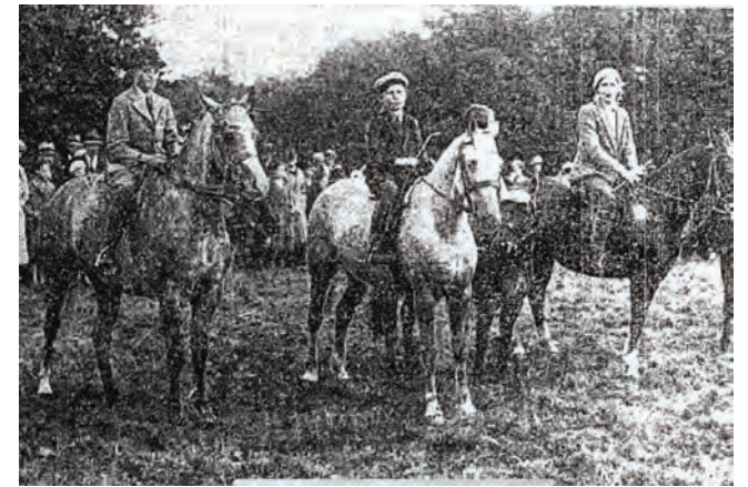
1935 - Competitors in the Children's Riding Class

It certainly was Iverk's finest hour as none of the above developments could have taken place on rented land.