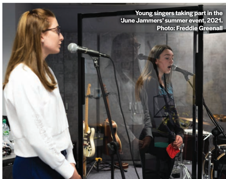
Young singers taking part in the June Jammers' summer event, 2021.