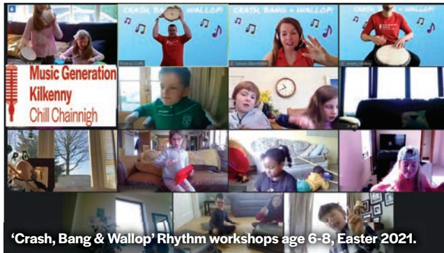
'Crash, Bang & Wallop' Rhythm workshops age 6-8, Easter 2021.

Creating access to performance music education for children and young people across Kilkenny city and county since 2019.